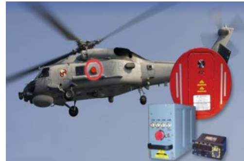
Figure 8. Automatic Deployable ELT (ELT AD)

ELT AD is designed for automatic activation and ejection from the aircraft in the event of a crash. Equipped with sensors to detect crash conditions, the unit autonomously deploys and begins transmitting a distress signal at 406 MHz to the Cospas-Sarsat satellite system. ELT AD features both automatic and manual activation options, guaranteeing signal transmission when manual intervention is impossible. This technology marks a significant advancement in aviation safety, offering a critical mechanism for swift emergency response 10 .