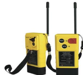
Figure 5. Survival ELT (ELT S)

ELT S is intended to be part of the aircraft's survival equipment and is not permanently attached to the aircraft. Stored within accessible locations, the device is designed for manual activation post-accident, serving as a quick retrieval in an emergency. ELT S is designed for manual activation and is meant to be used after an accident to signal for rescue. The portability and manual operation make the ELT S a critical tool for survival, particularly in situations where the primary ELTs (ELT AF/AP) fail to activate or are inaccessible.