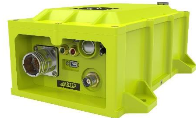
Figure 10. Distress Triggered ELT (ELT DT)

ELT DT is a specialized category of ELTs that activates based on specific distress signals or conditions within the aircraft, making it highly effective for emergency response and aviation safety. Unlike traditional ELTs that activate through manual intervention or impact detection, the ELT DT is designed to recognize predefined distress scenarios, such as significant altitude changes, unusual accelerations, or other parameters indicative of emergencies through the aircraft's monitoring systems 11 .