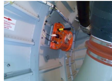
Figure 1. Automatic Fixed ELT (ELT AF)

The ELT AF is permanently affixed to the aircraft and engineered to activate automatically upon experiencing a significant impact or crash. The installation of the unit protects it from the crash forces and ensures successful distress signal transmission. The automatic activation mechanism relies on a G-switch sensor that detects sudden deceleration. ELT AF also incorporates a manual activation feature, enabling crew members or rescue personnel to activate as required.