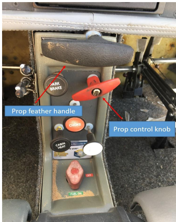
Figure 4. Propeller control on center console

The 'feather' setting aligns the propellers into the air stream to minimize drag during gliding flight. The 'feather' selection requires the engine to be switched off first and is made by pulling and turning the 'Prop feather handle', located above the 'prop control knob'. Turning the 'Prop feather handle' will apply the propeller brake to avoid wind-milling.