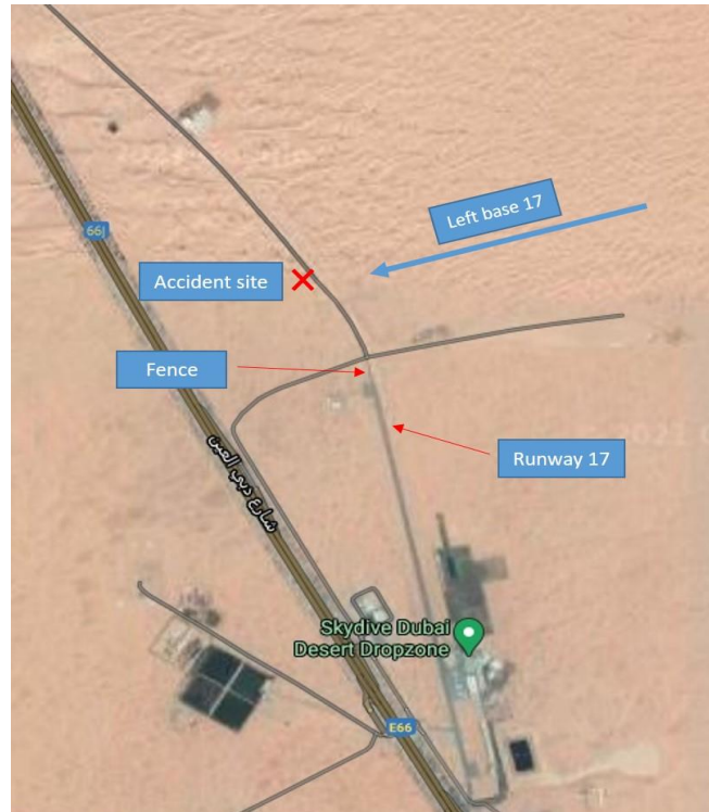
Figure 1. Aircraft flight direction on left base to runway 17

The Aircraft was severely damaged as a result of the ground impact.