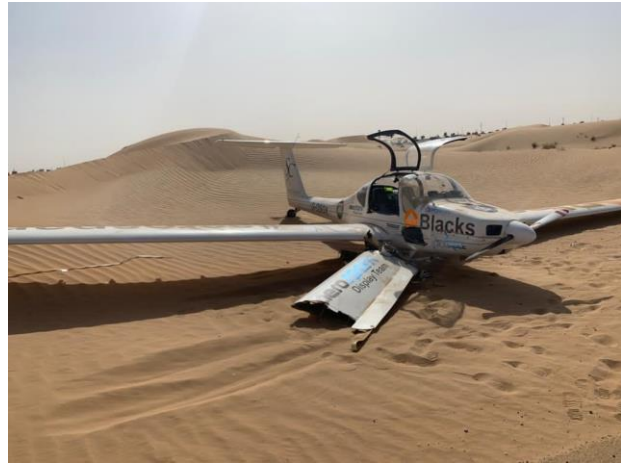
Figure 7. Aircraft damage