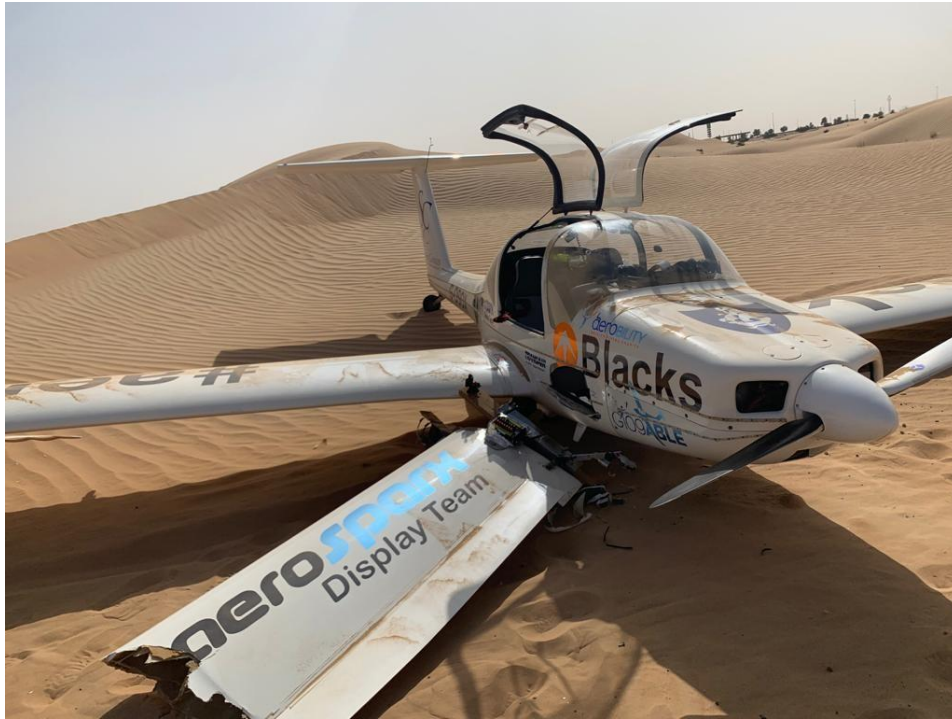
Figure 2. Damage to Aircraft

The right wing fractured and separated approximately 190 cm from the wing tip, the left main landing gear separated from the fuselage, the propeller spinner was dented, and the fuselage and engine cowling exhibited several areas of impact damage. (Figure 2)