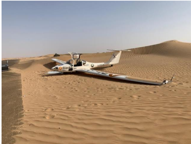
Figure 6. Aircraft location

The left main landing gear strut detached from the fuselage, and the right wing fractured approximately 190 cm from the wingtip. Damage was also identified on the lower fuselage and the engine cowling and the propeller spinner. The propeller was found in 'feather' pitch position. (Figure 7)